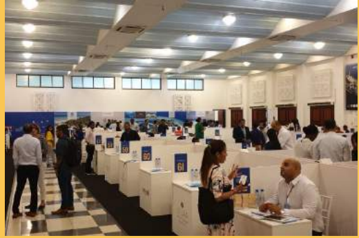
TTM Maldives 2019