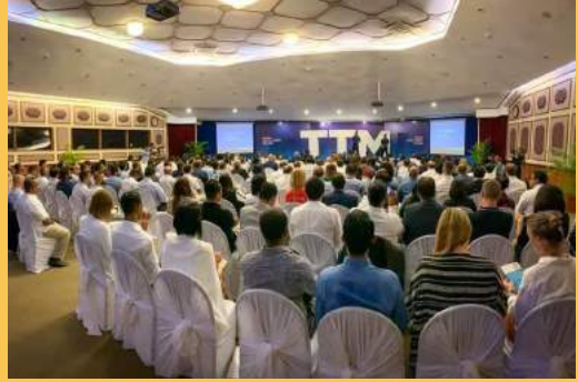
TTM Travel Summit 2019