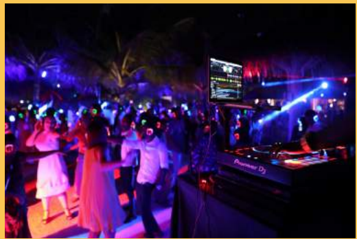
TTM Awards & Gala 2019