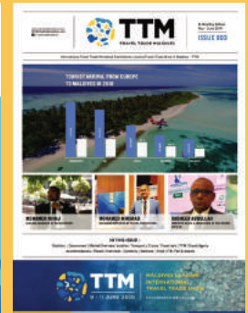
TTM Periodical & Show Publications

TTM online news portal www.traveltrademaldives.com